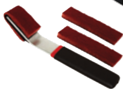
LISLE® Abrasive Pad Scraper #LIS-52600