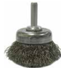
ATD® End Brush #ATD8258