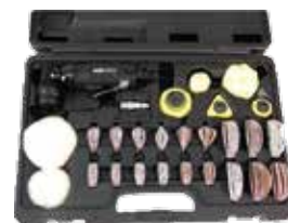
NESCO® Spot Repair Sander Repair Kit #NP-760K