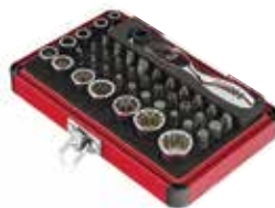
SUNEX® 44 Pc. 1/4" Dr Mini Dual Flex Head Ratchet w/ Socket & Bit Set #SUU-9732