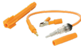
S&G TOOL® In-Line Spark Checker Kit for Recessed Plugs #SGT-23970