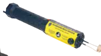
INDUCTION INNOVATIONS® Mini-Ductor® II #ICT-MD-700