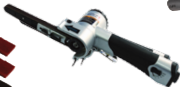
ASTRO PNEUMATIC® 3/8" x 13" Air Belt Sander with Three Belts #AST-3036