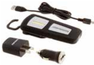
ATD® Saber® Rechargeable LED Pocket Light #ATD-80340