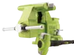
WILTON® 6.5" Utility Bench Vise and B.A.S.H® Sledge Hammer #WIL-11128BH