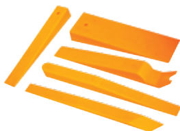
LISLE® 5 Pc. Wedge Assortment Set #LIS-69620