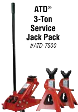
ATD® 3-Ton Service Jack Pack #ATD-7500