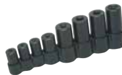
LISLE® Tap Socket Set #LIS-70500