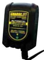
SOLAR® CHARGE IT! 12 Volt Smart Charger/Maintainer #SOL-4501