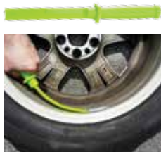
MUELLER KUEPS® Wheel Weight Remover #MKP-282230