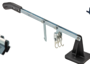
H & S AUTOSHOT® Uni-Puller™ Stud & Claw Lever Pulling Tool #UNI-7600-01