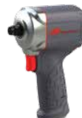
INGERSOLL RAND® 3/8" Ultra Quiet Compact Impact Wrench #IRC-15QMAXSSB